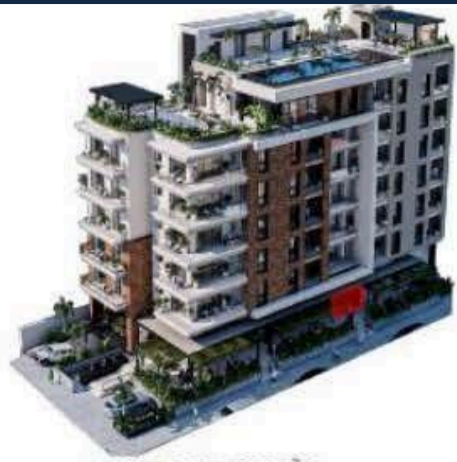
VISTA CALLE ESPAÑA