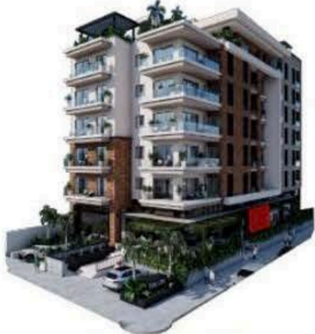
VISTA CALLE HAMBURGO