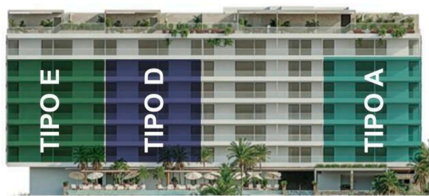
UBICACIÓN EN FACHADA

Superficie interior _____ 160.59 m 2 Superficie terraza _____ 51.18 m 2 Superficie total _____ 211.77 m 2 # Cajones _____ 2